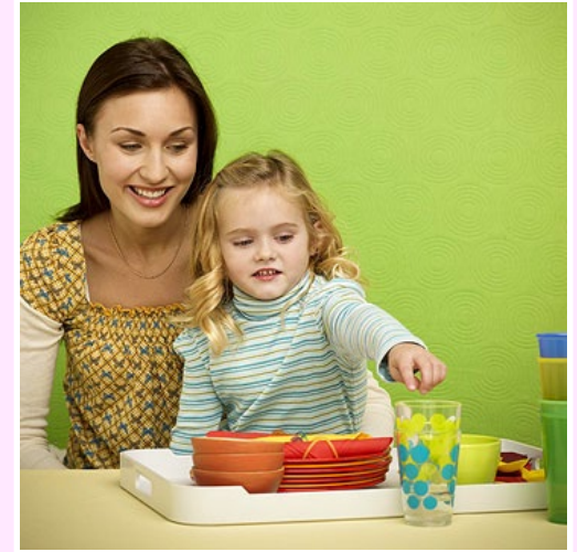
Set the table