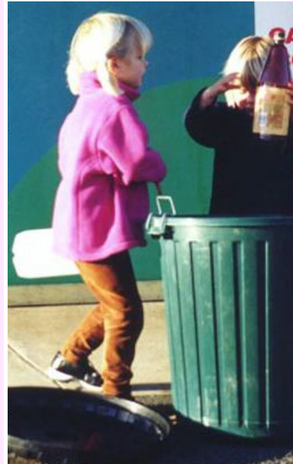
Take out the rubbish