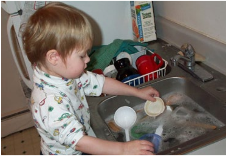
I can wash up