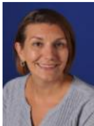
Class Teacher (all week)