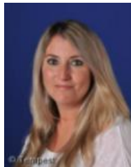
Teaching Assistant (mornings)